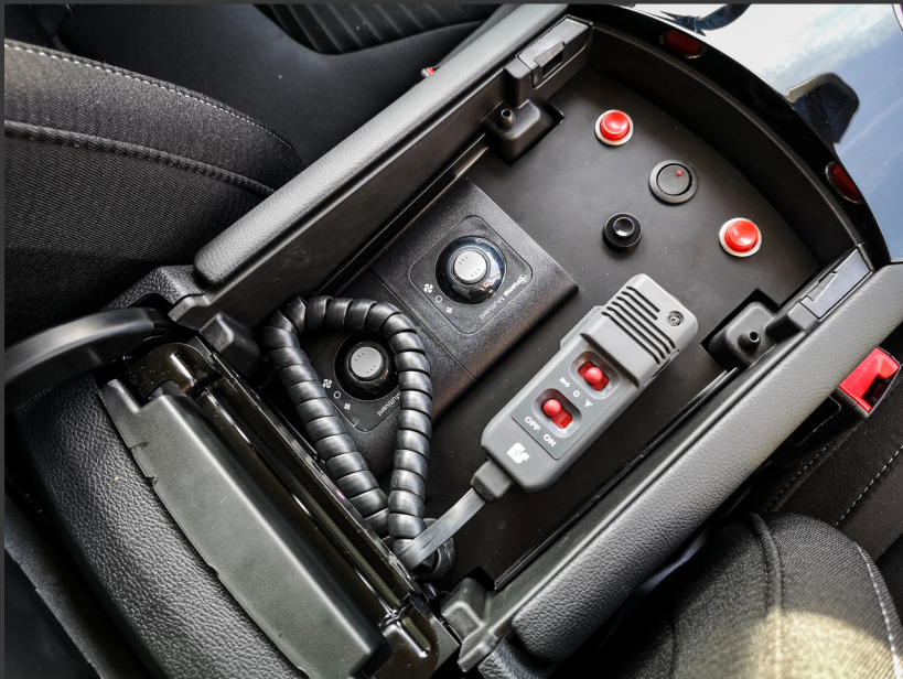
Control of the functions of the dog box in the front armrest (example)