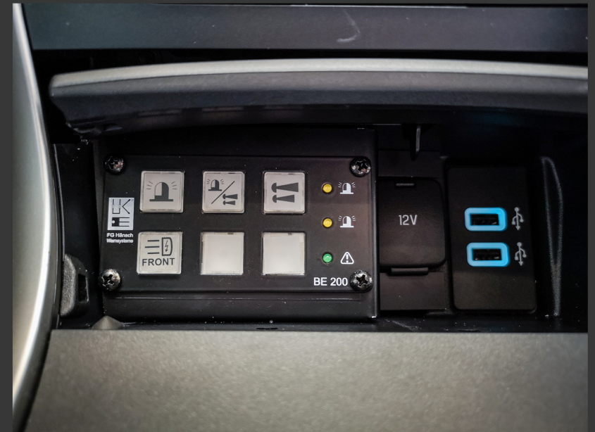
Hidden installation of the special signal control (example, ashtray in the centre console)