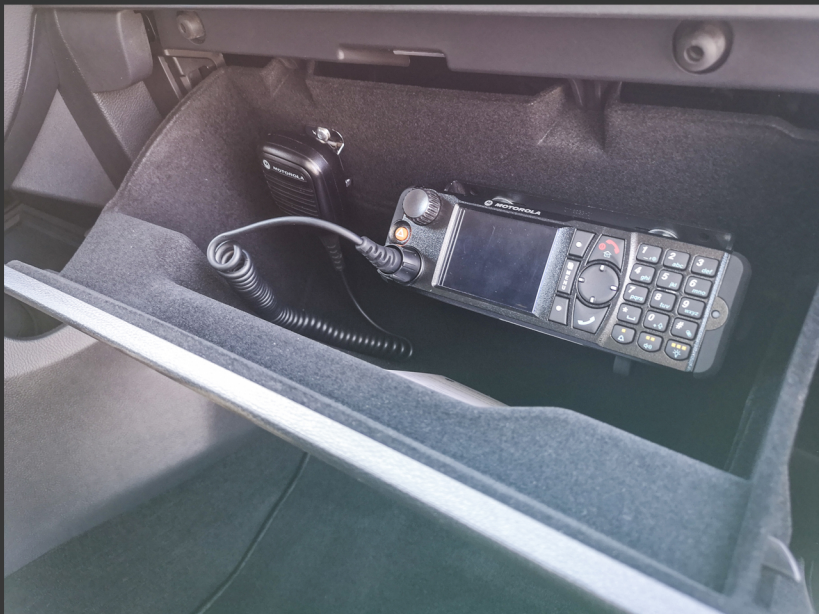
Hidden installation of the radio in the glove box (example, alternatively e.g. in the FEM box)