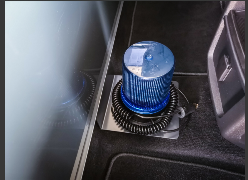
Blue light holder in the rear, magnetic (example, alternatively under the driver's seat)